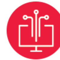
TECHNOLOGY, MEDIA & ENTERTAINMENT, TELECOMMUNICATIONS