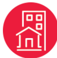
REAL ESTATE & CONSTRUCTION