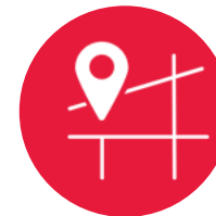
SHIPPING AND TRANSPORT