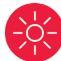
NATURAL RESOURCES & ENERGY